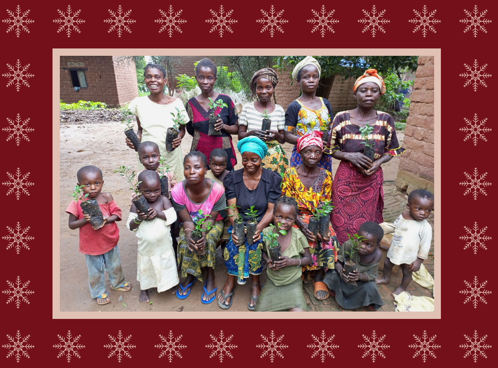
Democratic Republic of the Congo, APAA trained 300+families