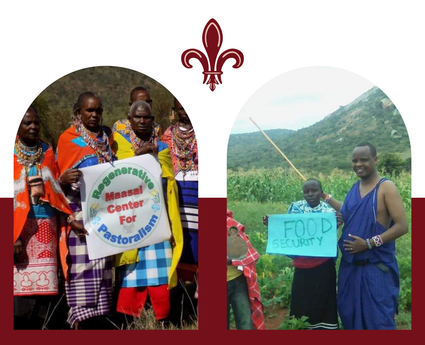
In Ejiado County Kenya, MCRP is collecting native seeds, planting and tending them in our new nursery, and restoring our degraded lands brining back important habitat for endangered species and protecting our traditional way of life.