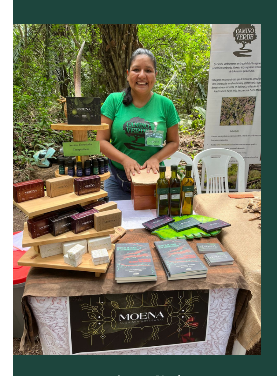
Camino Verde, Peruvian Amazon