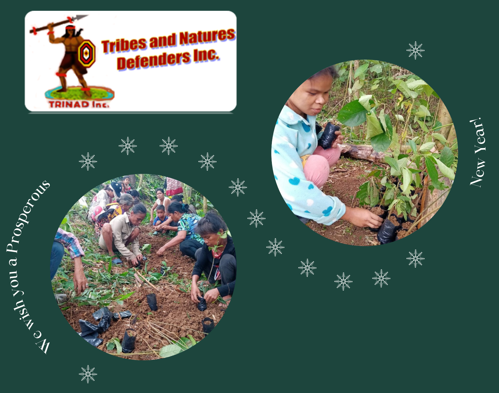
In the Philippines, Tribes and Nature's Defenders planted 20,000 native trees. We continue to raise awareness and fight to protect our ancestral lands and indigenous traditions.